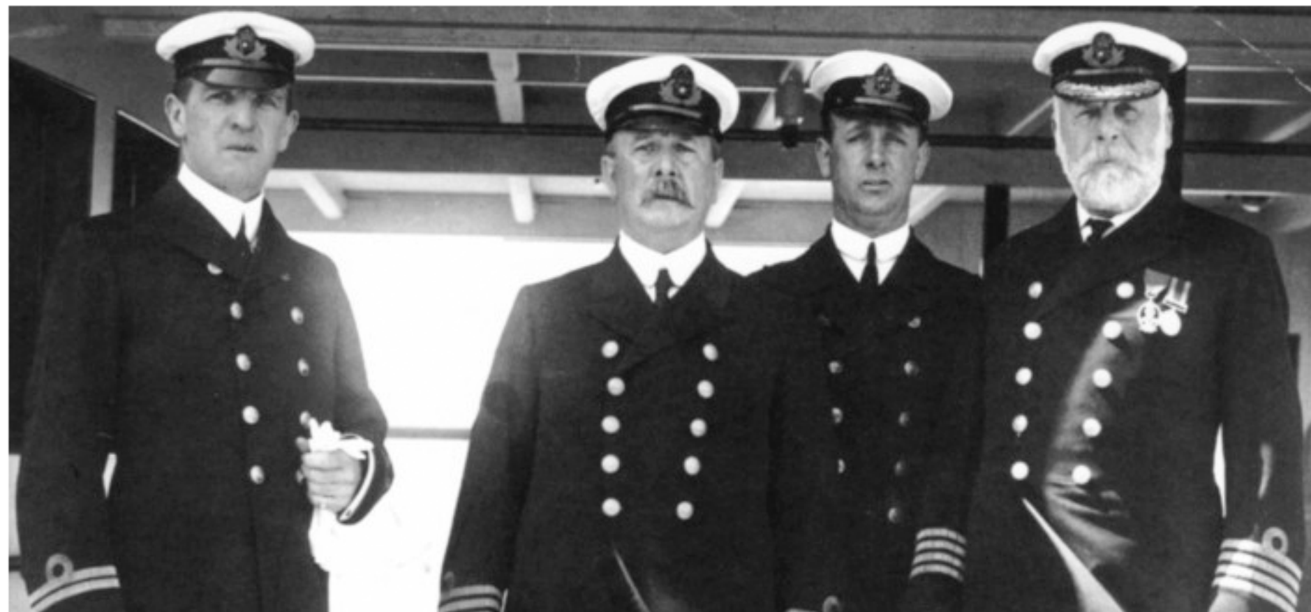
WILLIAM MURDOCH (FAR LEFT) AND CAPTAIN EDWARD J. SMITH (FAR RIGHT)

In point of fact, Murdoch gave his life to save passengers, helping them into boats, and then throwing deck chairs overboard so that drowning passengers would have something to keep them afloat. Murdoch is generally recognized by historians and Titaniphiles as a hero who never wavered in the performance of his duty and who gave his life for women and children.